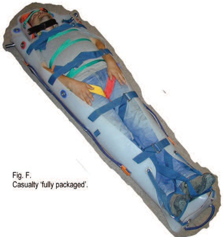
Fig. F. Casualty 'fully packaged'.