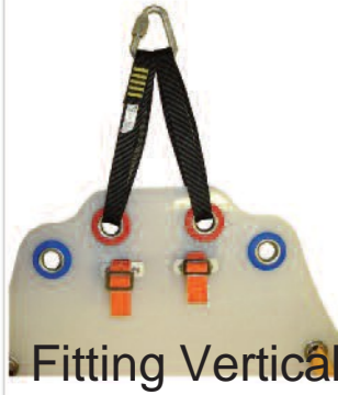
Sewn Slings and karabiners OR Delta Mallion Rapide